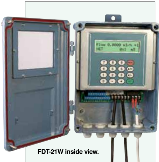
FDT-21W inside view.

FDT-21W ultrasonic flow meter is designed to measure the fluid velocity of liquid in a full/closed pipe. It is a measurement system which is both easy to install and use. The FDT-21W operates according to the difference in the transit time of flight measured, and determines the flow velocity by measuring the travel time of a pulse from one transducer to the next. Flow in the same direction takes less time to travel to the second transducer than does flow in the opposite direction. Electroacoustic transducers receive and emit brief ultrasonic pulses through the liquid of the pipe. Transducers are vertically placed at both sides of the measured pipe. Sensors are placed on the pipe and fastened by means of a clamp. The display will quickly show the flow velocity. The FDT-21W can be used for metallic, plastic and rubber tubes.